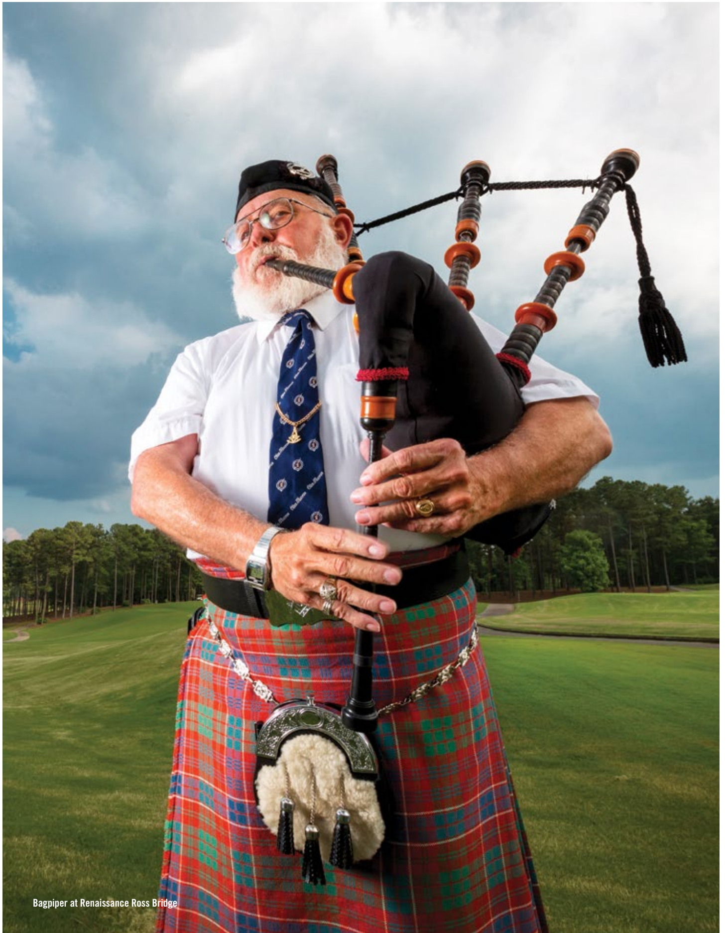
Bagpiper at Renaissance Ross Bridge