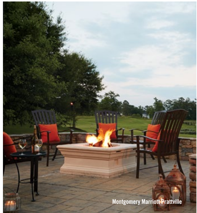
Montgomery Marriott Prattville

This hotel has 15,000 square feet of technology-equipped event space, a business center, and a 96-seat amphitheater. For golfers wanting to move to the area, National Village offers upscale homes and cottages adjacent to Grand National. From a primary residence to second homes, National Village has great options and golf waiting for you. For more on this upscale Trail residential option, visit www.nationalvillage.com .