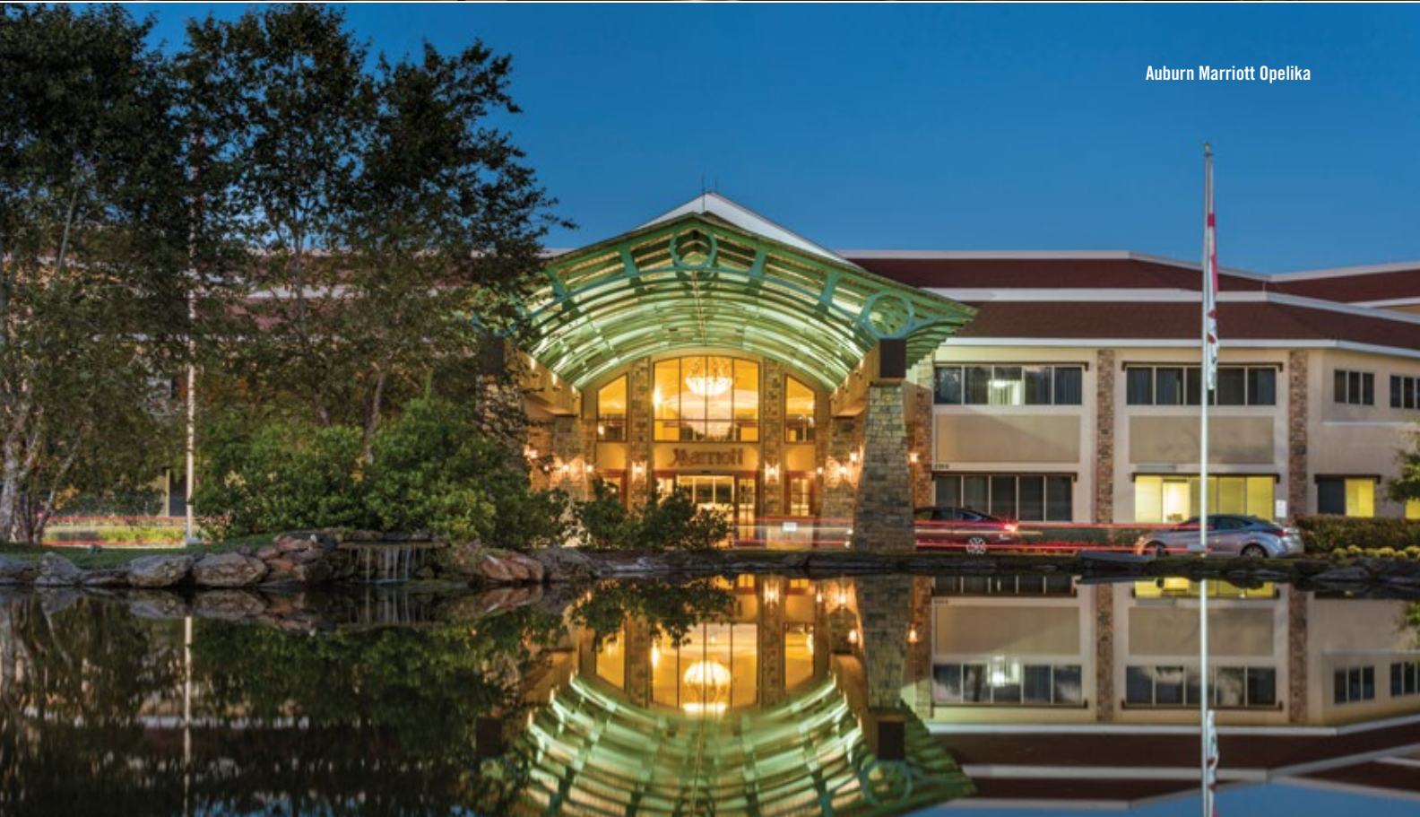
Auburn Marriott Opelika