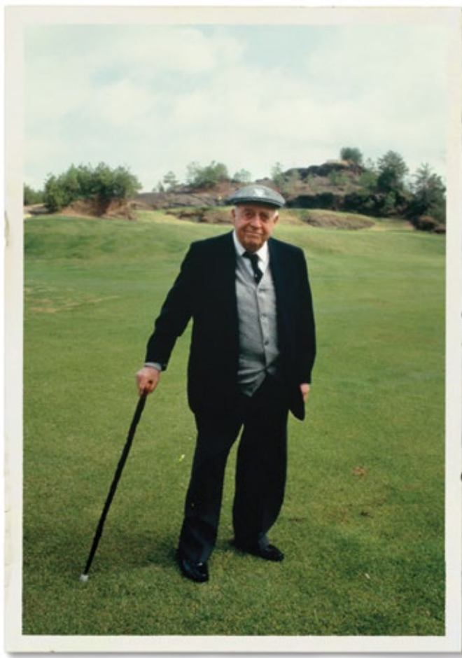
Above: Robert Trent Jones, Sr.

They were underutilized in the early years but are getting more use these days, he said, because of player-development programs, particularly in larger markets such as Birmingham and Mobile. Those programs should help generate some new local customers to complement all of the Trail customers arriving from outside of Alabama. ■