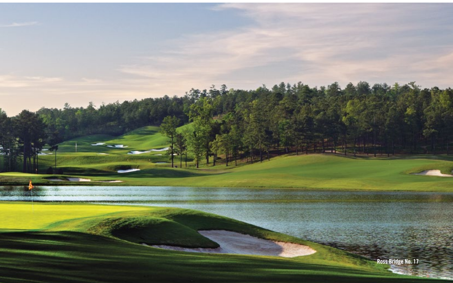
Ross Bridge No. 17

SCENERY The Judge at Capitol Hill has one of the most incredible opening holes in golf. As you stare down a 200-foot bluff to a sliver of a fairway with a well-protected peninsula green that juts out into the Alabama River, it will take your breath away.