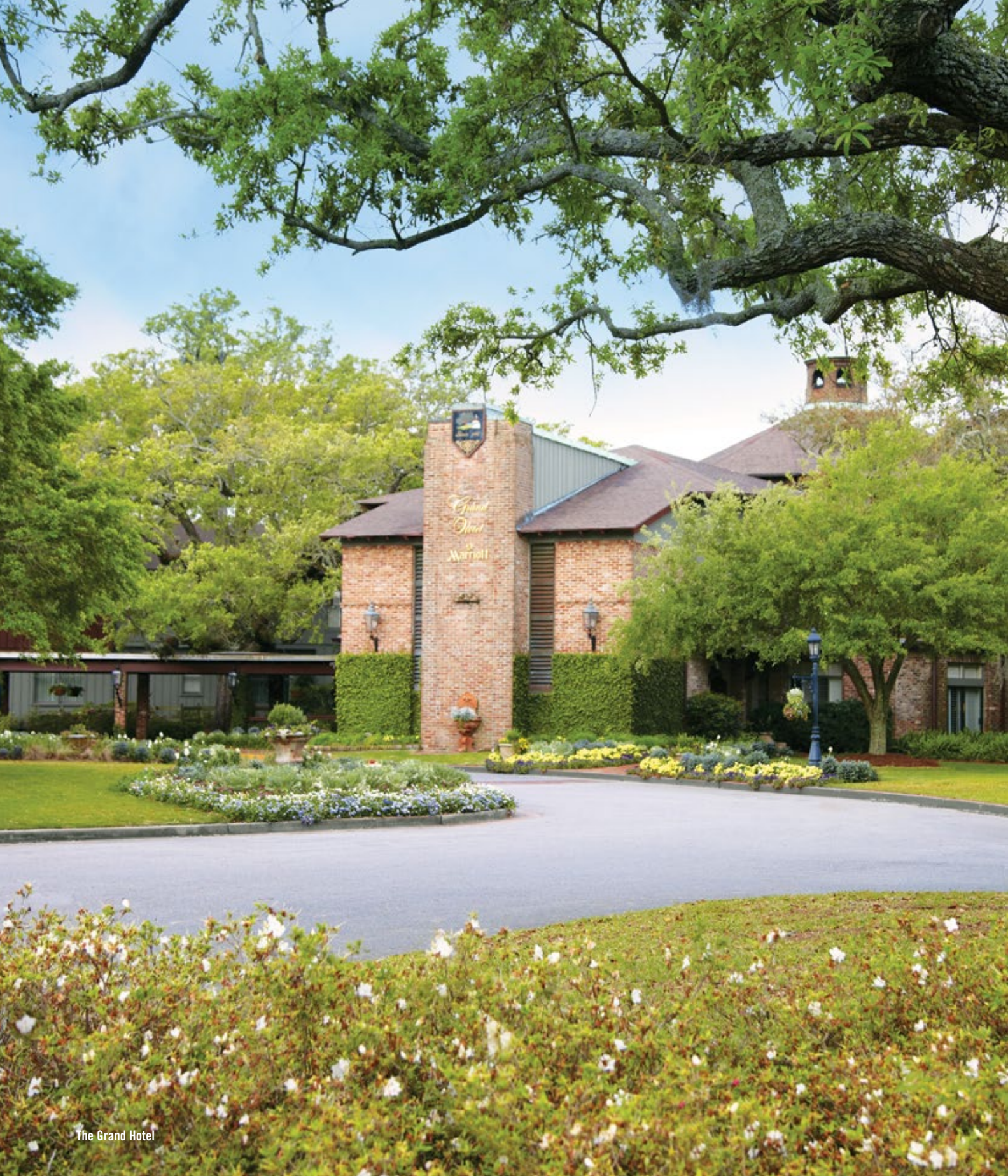
The Grand Hotel