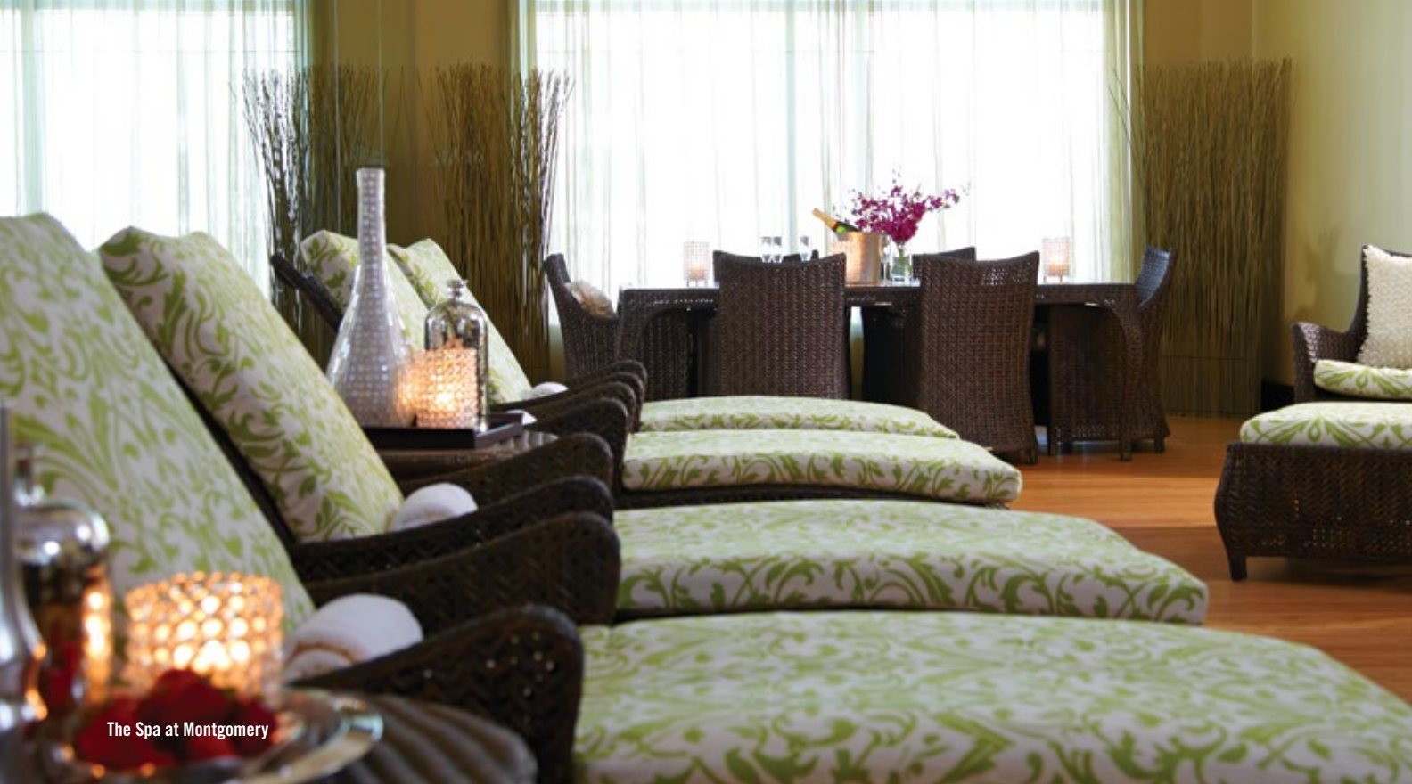
The Spa at Montgomery