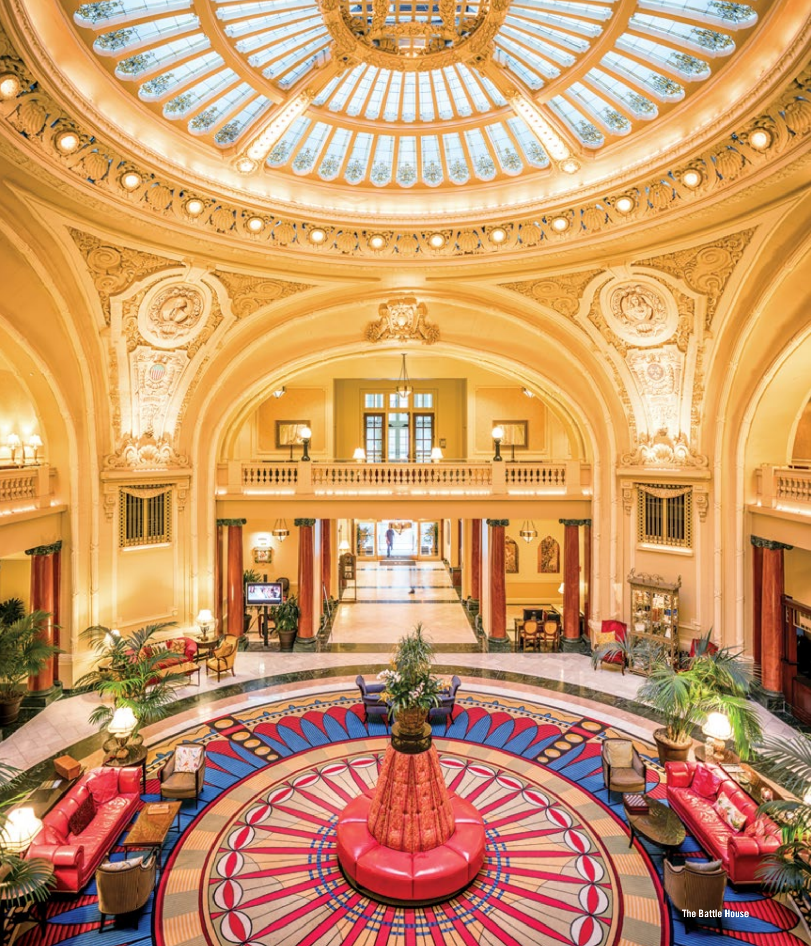
The Battle House