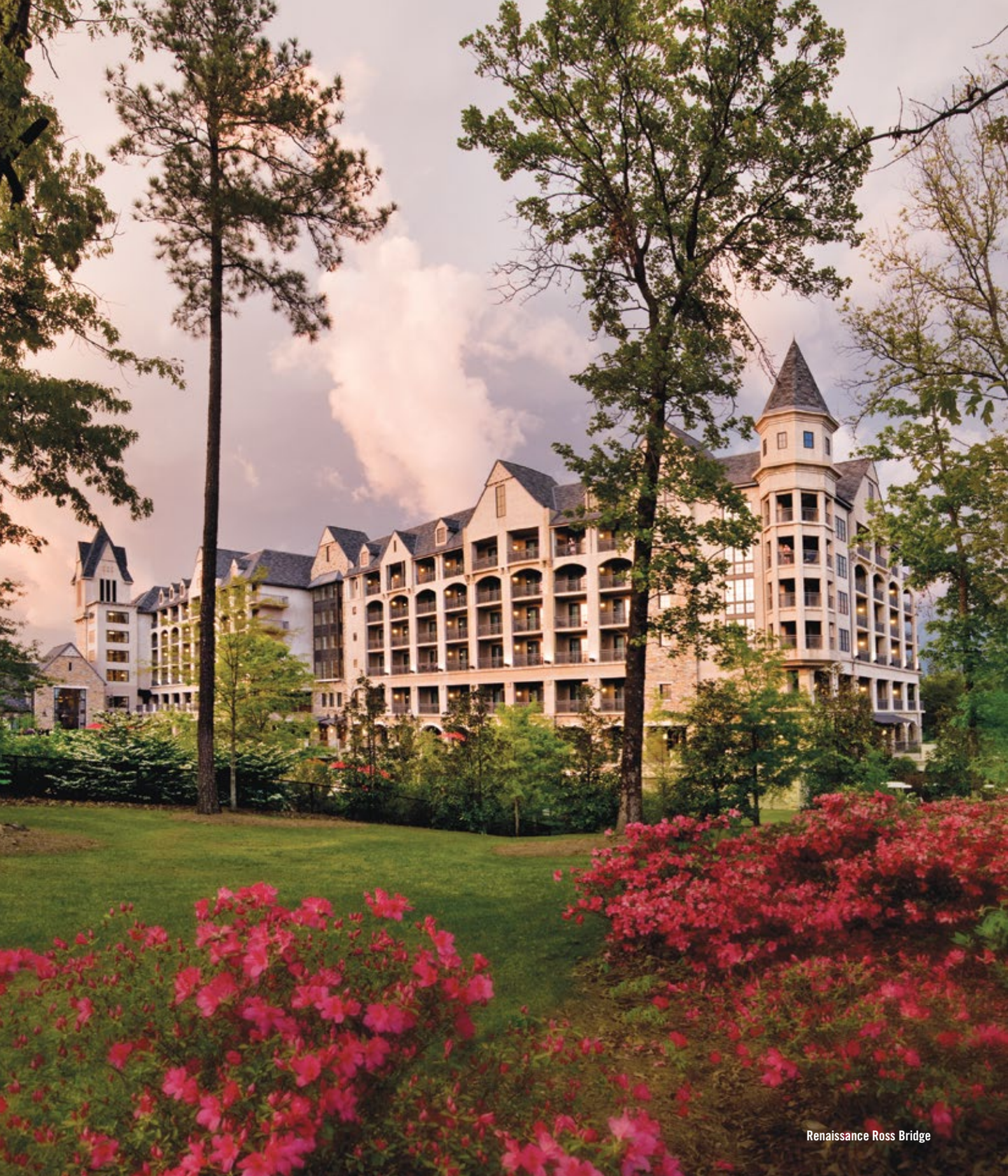
Renaissance Ross Bridge