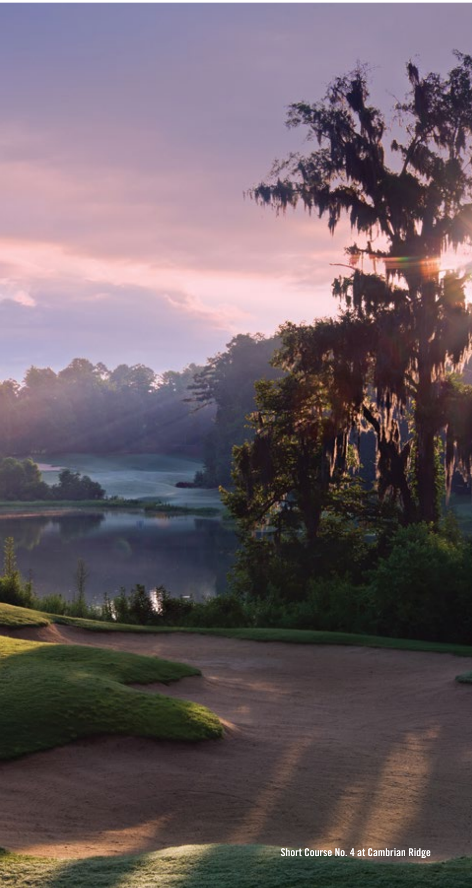
Short Course No. 4 at Cambrian Ridge