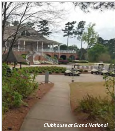
Clubhouse at Grand National

plenty of mind-boggling water carries. Arguably my favourite hole is the 245 metre, par-4 11th hole which features a split fairway (by a water hazard) that could see you change your mind two, three, maybe four times on the tee.