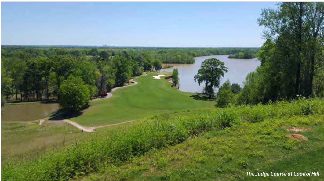
The Judge Course at Capitol Hill