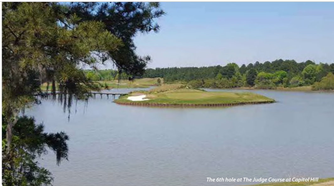
The 6th hole at The Judge Course at Capitol Hill

It's with some regret that I did not have time to play the other two courses at Capitol Hill; The Legislator and The Senator. Home to the LPGA's Yokohama Tire LPGA Classic, the Senator is a links-