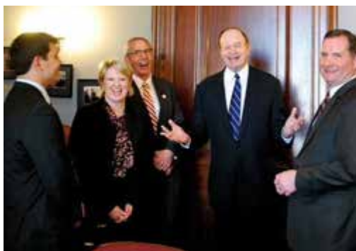
Senator Shelby meeting with Alabama educators

This is a series of articles about Alabama Success Stories. Please let us know if you have a similar success story you would like to share with the RSA membership. You may contact us at communication.correspondences@rsa-al.gov . ●