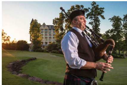
Renaissance Ross Bridge in Hoover

U .S. News & World Report this week released its rankings of the top 25 hotels in Alabama, and the biggest winner was the Robert Trent Jones Golf Trail. The rankings are based on an analysis of travel experts and user opinions, per U.S. News .