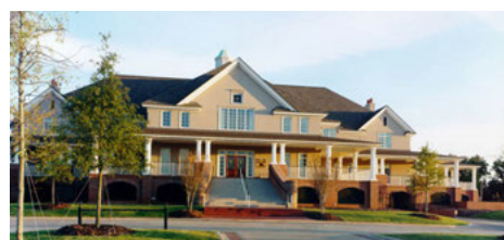
Clubhouse, Capitol Hill