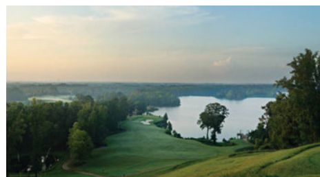
Judge Course, Hole #1, Capitol Hill

The golf complex has spiraling wooden cart paths and high bridges for traversing the high bluff to the water features on the courses. There are three distinct 18-hole championship courses (The Judge, The Senator, and The Legislator). The Senator (a Scottish-Links style course) was built on a cotton field and has no trees but high mounding separating holes, tall fescue rough, and 193 pot bunkers. The Legislator winds up and down the bluff through trees with mosses and vines and a cypress swamp. The Judge plays around 200 acres of backwater and one constructed lake with the opening hole dropping 200 feet. The clubhouse has 52,417 sf (the Trail's largest) including an 8,400 sf wrap around porch (with a view of downtown Montgomery), pro shop, bar/restaurant, locker rooms, and meeting rooms. There is a