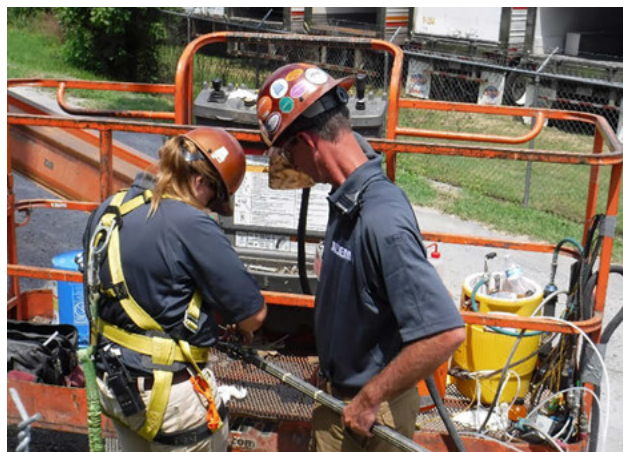
ADEM Testing Air Emissions

state of the environment in Alabama is among the best in the nation and getting better.