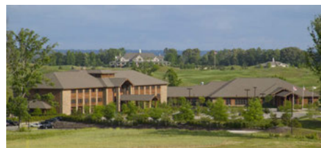
Montgomery Marriott Prattville Hotel & Conference Center at Capitol Hill

360-degree practice range, short game area, and Golf Academy building.