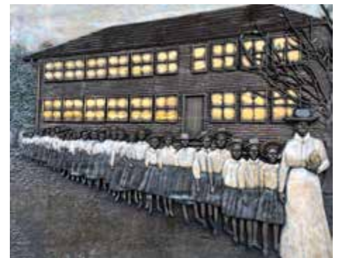
Ms. White’s Industrial School for Girls