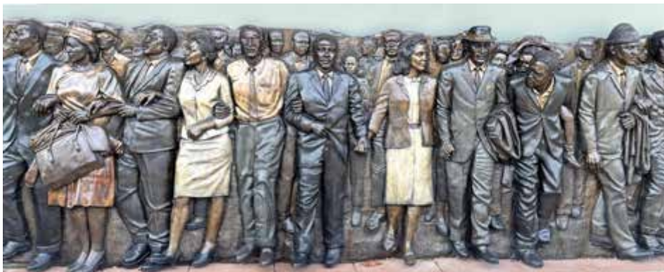
Dr. King Leads the Final Stage of the Selma to Montgomery March

Be sure to check out these incredible pieces at the RSA Centennial Hill Building on Jackson St! ●