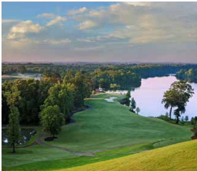
Hole #1, Judge Course, Capitol Hill

rounds and new memberships. Lakewood hosted the 2021 USGA's Women's Senior Amateur tournament. The Colony at The Grand, the RSA's adjacent planned community, added a large number of houses with new households playing golf at Lakewood. The Grand Hotel Golf Resort & Spa, Autograph Collection was a Top 3 Nominee for Alabama's Best Golf Hotel for 2021 by World Golf Awards™.