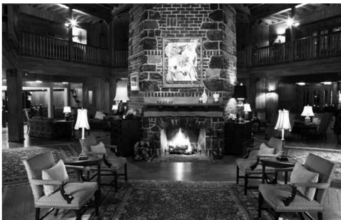
Grand Hotel Marriott Resort, Point Clear

Visit your hotels and experience what the world is talking about when they think of Alabama. ■