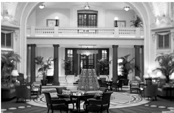
The Battle House Renaissance Mobile Hotel, Mobile