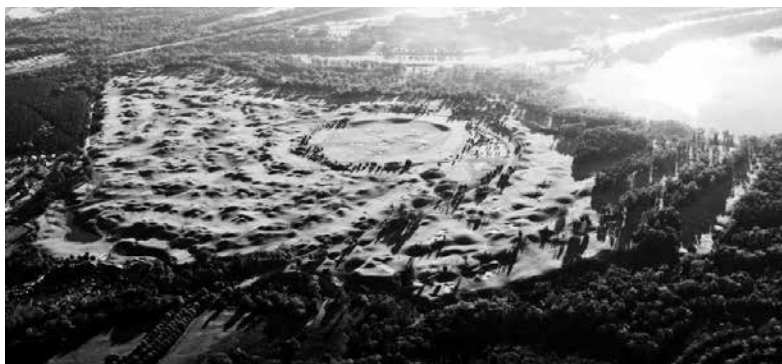
RTJ Capitol Hill, Prattville

northern Alabama and fields of crops as well as yards cluttered with ragged furniture and old kitchenware that gave them the feel of a permanent yard sale. There were roadside joints selling chicken wings, and one agricultural concern with a sign that read "Funny Farm."